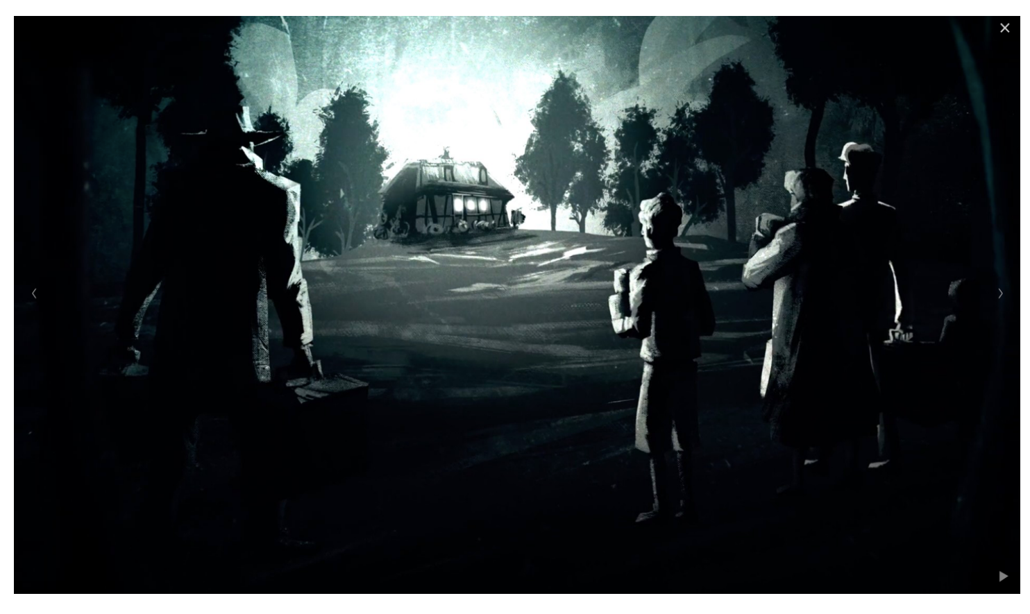
Finding refuge in the home of a Danish priest