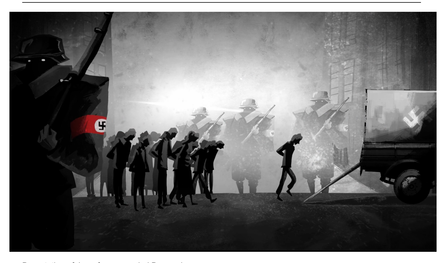
Deportation of Jews from occupied Denmark

The Melchior family leaving its home on route to Sweden