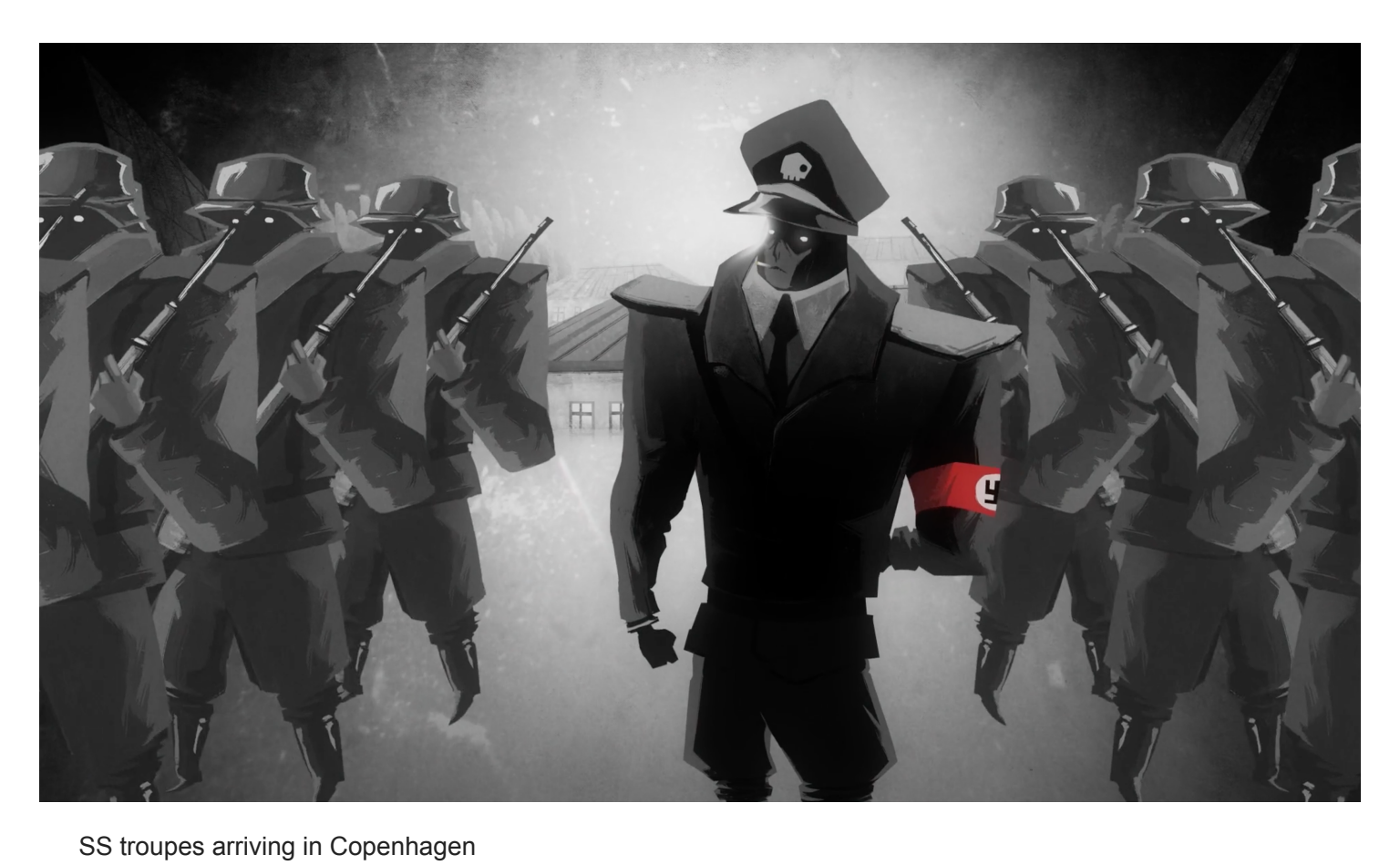
SS troupes arriving in Copennagen