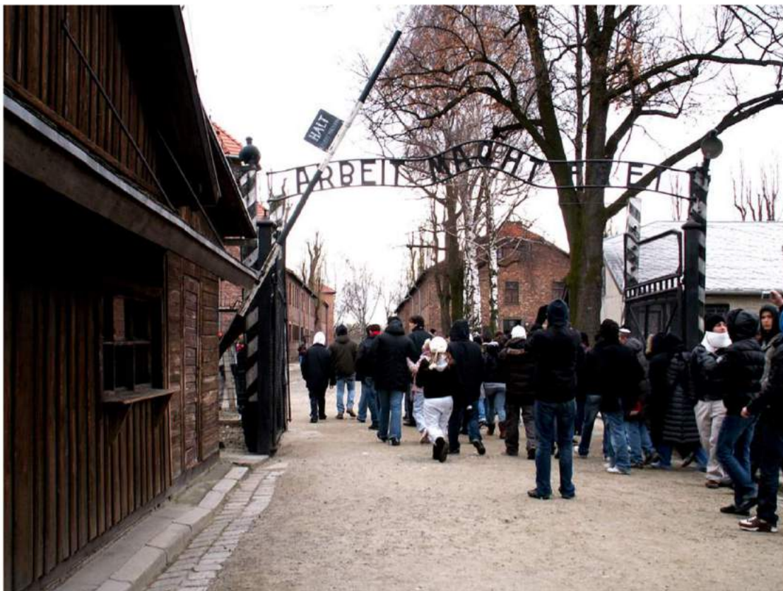
HIA Senior Fellows visit Auschwitz-Birkenau during the Relevance of the Holocaust Program in 2008.