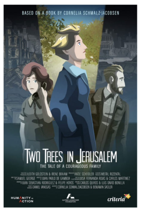
Two Trees in Jerusalem

For more information and press kits, please visit <a href="https://humanityinaction.org/films/traces/">humanityinaction.org/films/traces/</a>.